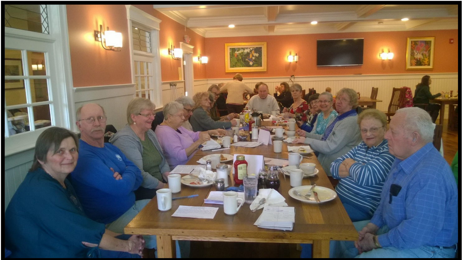
Attendees at the Council on Aging Chat & Chew meet & greet with the COA Director, April 18, 2018

Special thanks to DS Graphics for generously printing this month's COA Senior Scoop news- letter advertisement free!